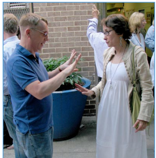
"Now, this is how it is!"