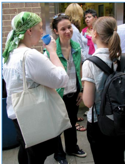
Girl talk at the BBQ

Even though Hillary got the most of the popular vote, she didn't get the nomination. But she is a person of pride and stature and grace and now is campaigning with Barack to ensure the Democrats once again lead the government. Once again I will join her.